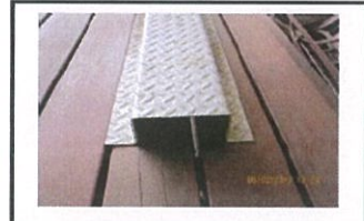
CLASS 12 PVC PIPE & CHECKER PIPE CHANNEL