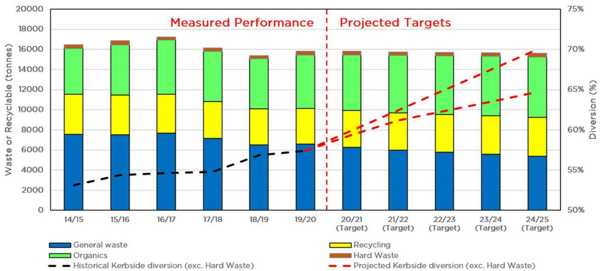
Figure 1: Projected kerbside collection target for Council

Council has one of the highest landfill diversion rates in South Australia and, compared to other metropolitan councils, a competitive waste spend per property. Figure 1 outlines Council's waste diversion and future projection of residential waste performance. Council plans to build on its success and continue to reduce general waste volumes (shown in blue in Figure 1).